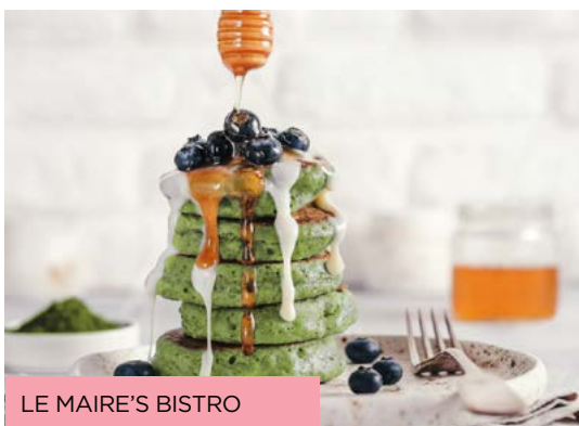
LE MAIRE'S BISTRO