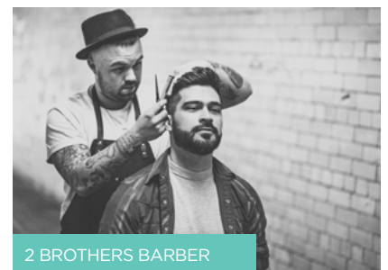
2 BROTHERS BARBER