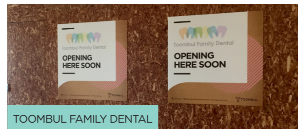
TOOMBUL FAMILY DENTAL