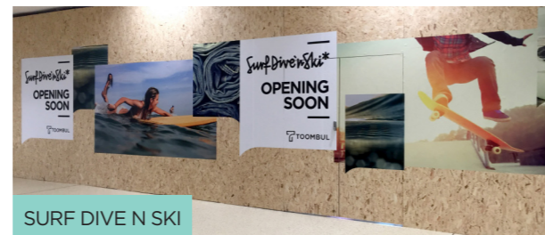
SURF DIVE N SKI