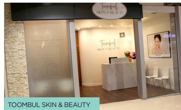
TOOMBUL SKIN & BEAUTY